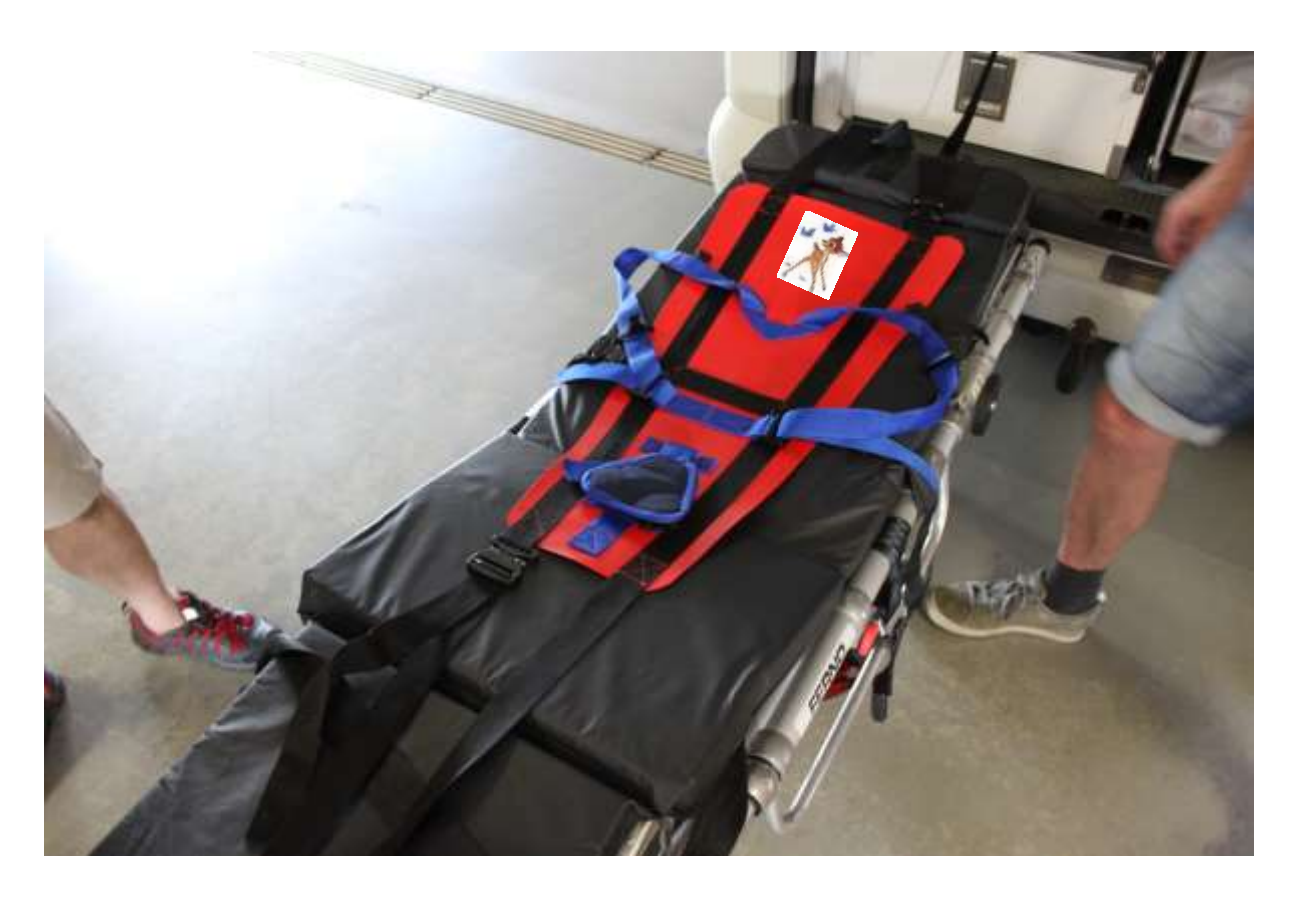
Child, 7 weeks old, body height 50 cm